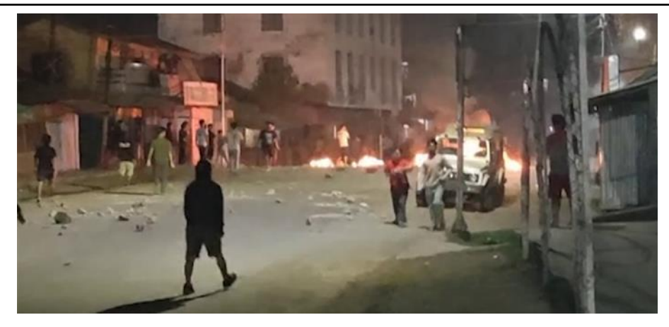
A screenshot from footage of violence in Manipur, where Christians have been particularly targeted

Response to a peaceful protest turned violent in Manipur, India, and Christians have been especially singled out for persecution. At least 70 believers have been killed, and large numbers remain homeless.